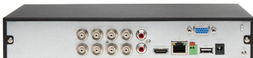
In the kit: