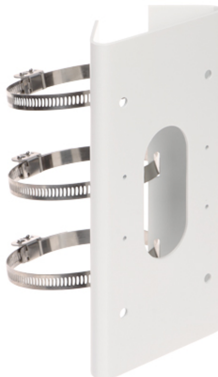
Mount designed to camera installation on a pole.

The device must be secured against contact with caustic, staining and viscous fluids.