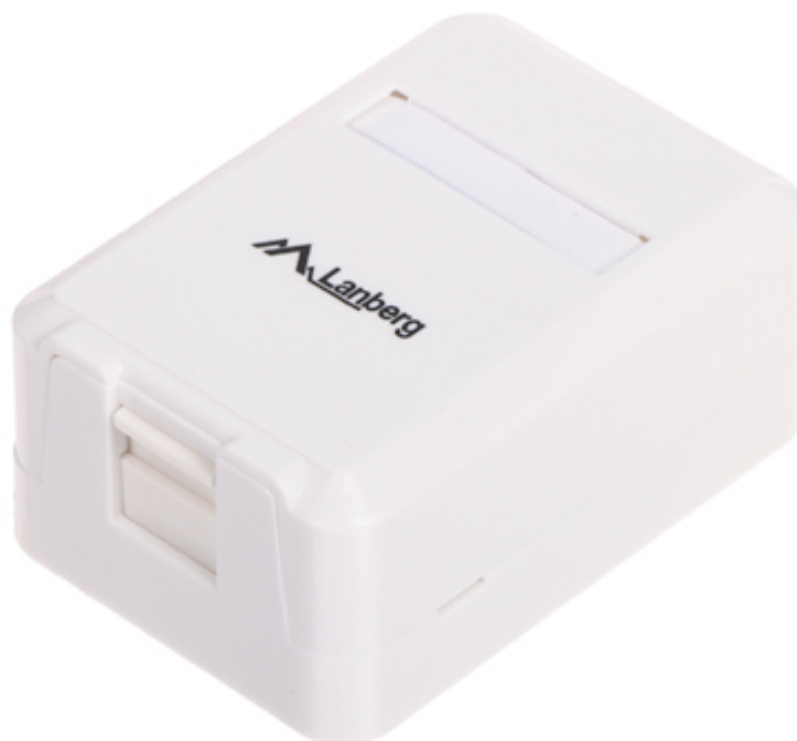
Mount box for KEYSTONE connectors.

The device must be secured against contact with caustic, staining and viscous fluids.