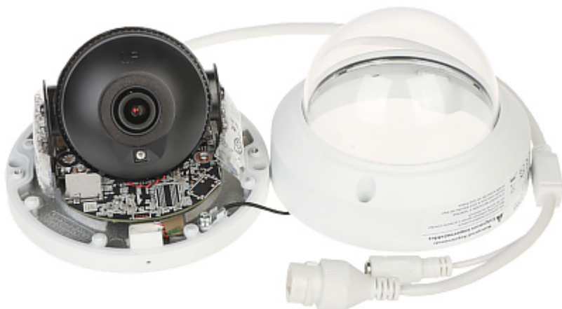
Memory card slot: