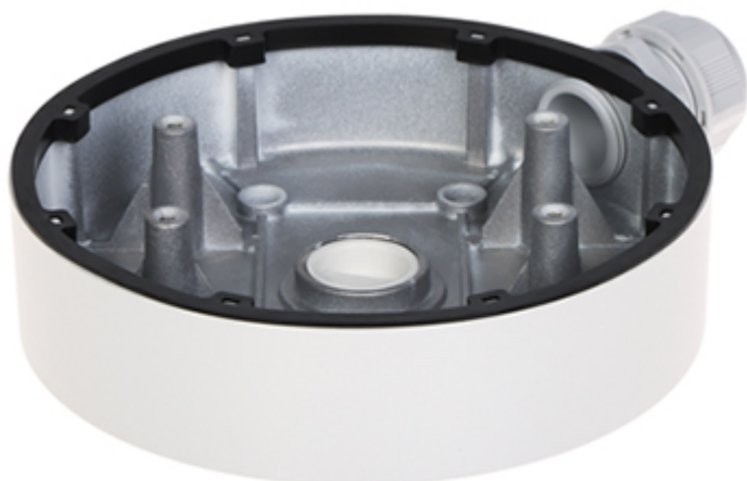
Wall mounting side view: