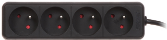
CEE 7/7 plug: