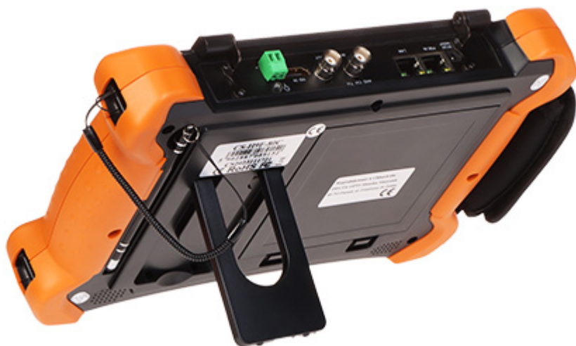
Place for battery: