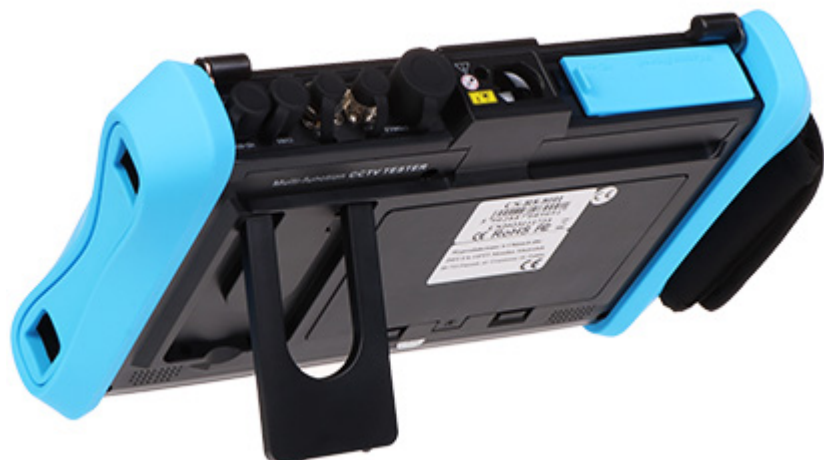
Place for battery: