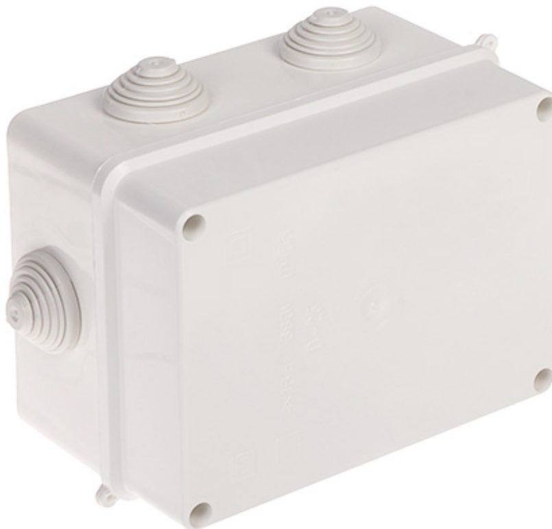
Surface mounting box, insulation, branching, 6-intake with non-threaded cable glands.

The device must be secured against contact with caustic, staining and viscous fluids.