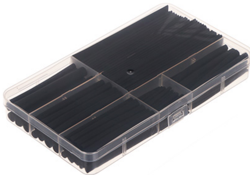
The set of heat-shrinkable tubing.

The device must be secured against contact with caustic, staining and viscous fluids.