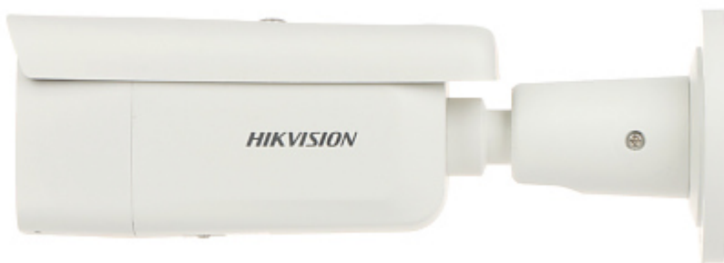
Memory card slot and "Reset" button: