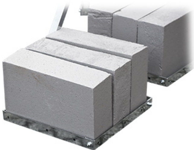
Individual elements of the support: