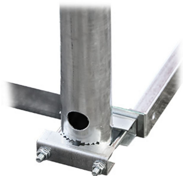
Connection of sections: