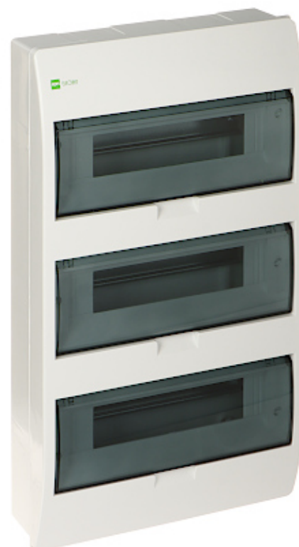
3-row 36-modular surface-mounting distribution electric cabinet.

The device must be secured against contact with caustic, staining and viscous fluids.