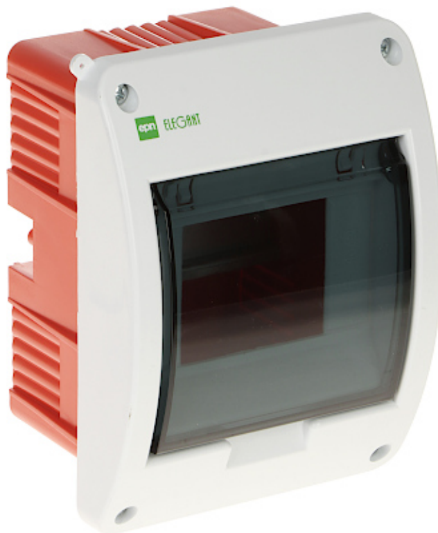
1-row 5-modular flush-mounting distribution electric cabinet.

The device must be secured against contact with caustic, staining and viscous fluids.