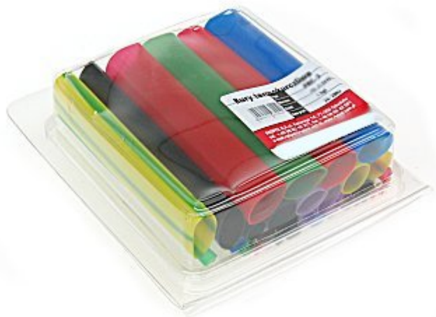
The set of heat-shrinkable tubing.

The device must be secured against contact with caustic, staining and viscous fluids.