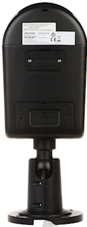
Memory card slot and "Reset" button: