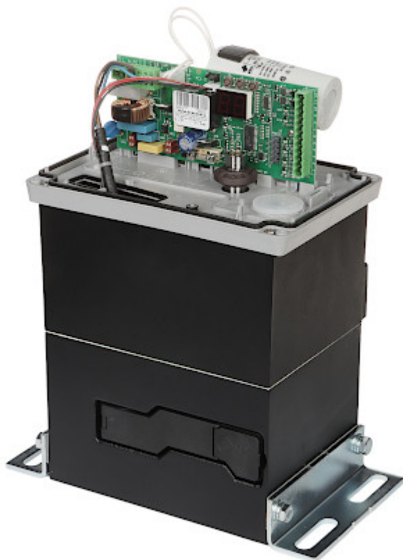
Gate operator controller: