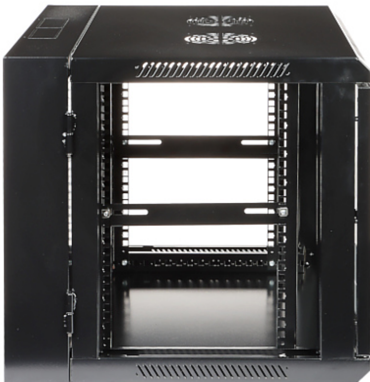
Holes for fan coolers: