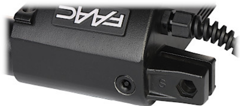
Gate operator controller: