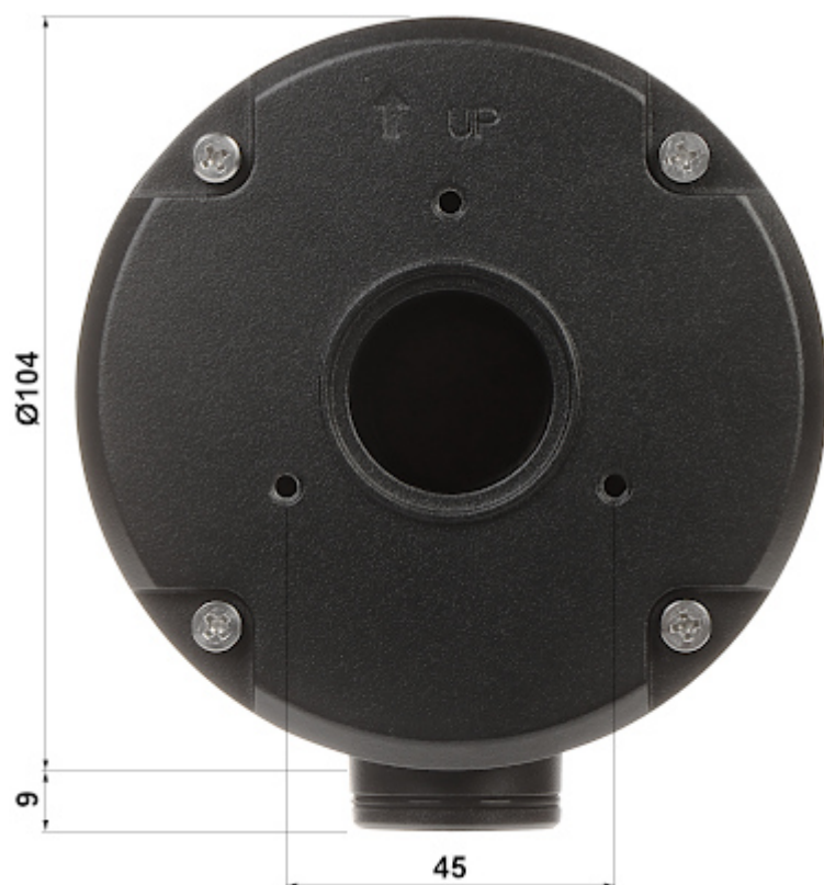
View of the ceiling mounting side: