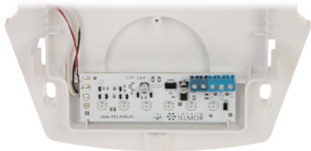
Mounting side of the housing box: