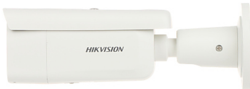
Memory card slot: