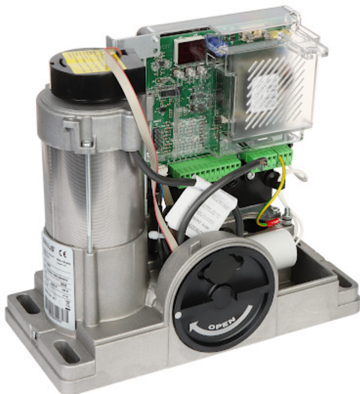
Gate operator controller: