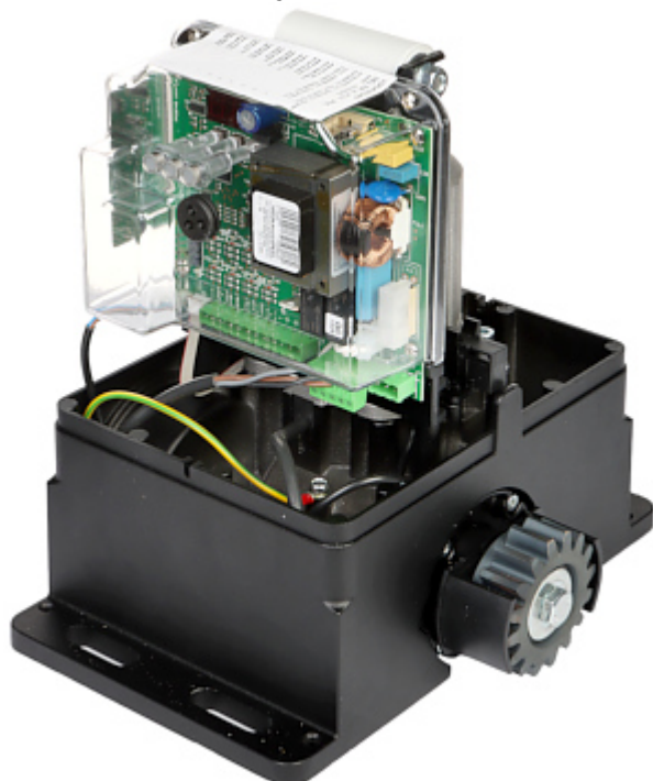
Gate controller connectors: