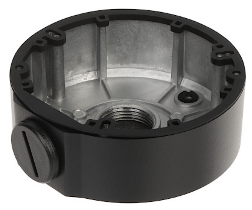
View of the ceiling mounting side: