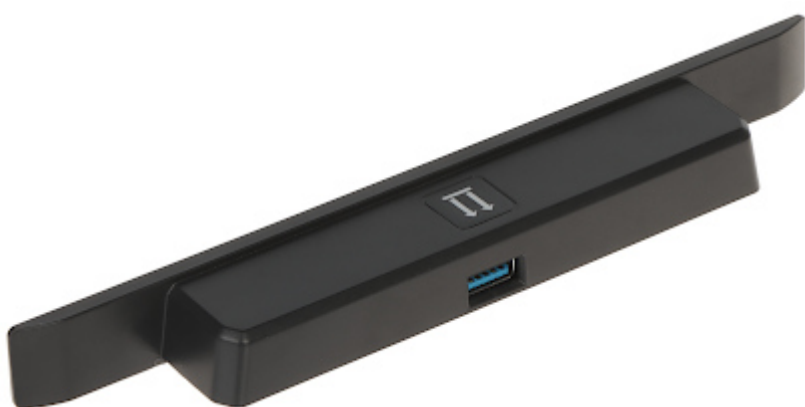
Dimensions with bracket: