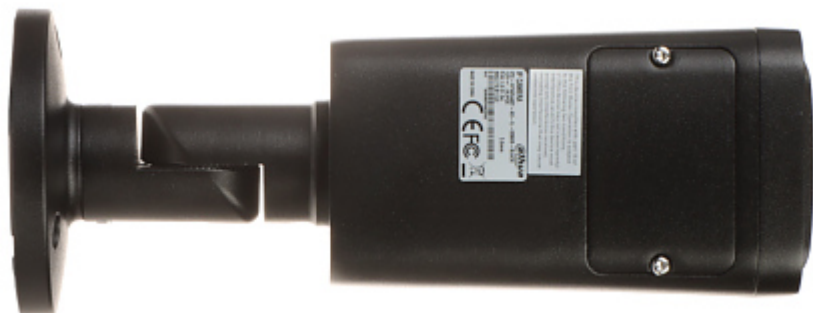
Memory card slot and "Reset" button: