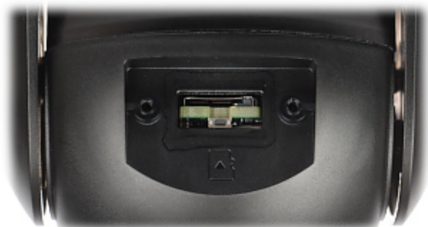
SIM card slot: