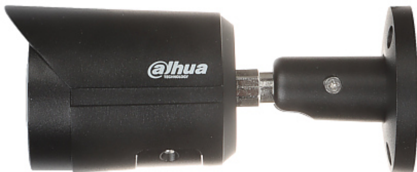
Memory card slot and "Reset" button: