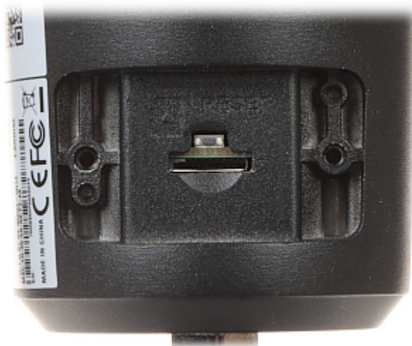
Camera mounting side view: