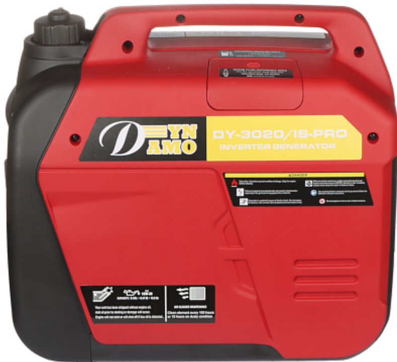
Side view after opening the cover: