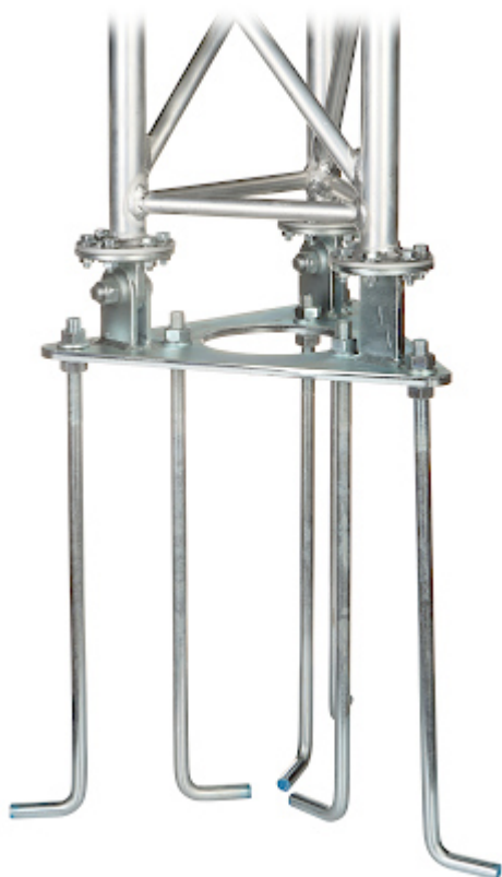
Method of mounting: