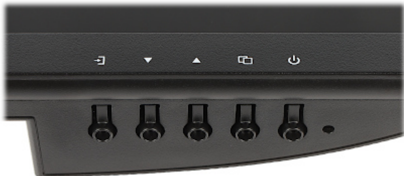
OSD menu control keys: