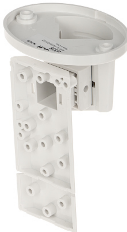
Bracket for motion detectors.

The device must be secured against contact with caustic, staining and viscous fluids.