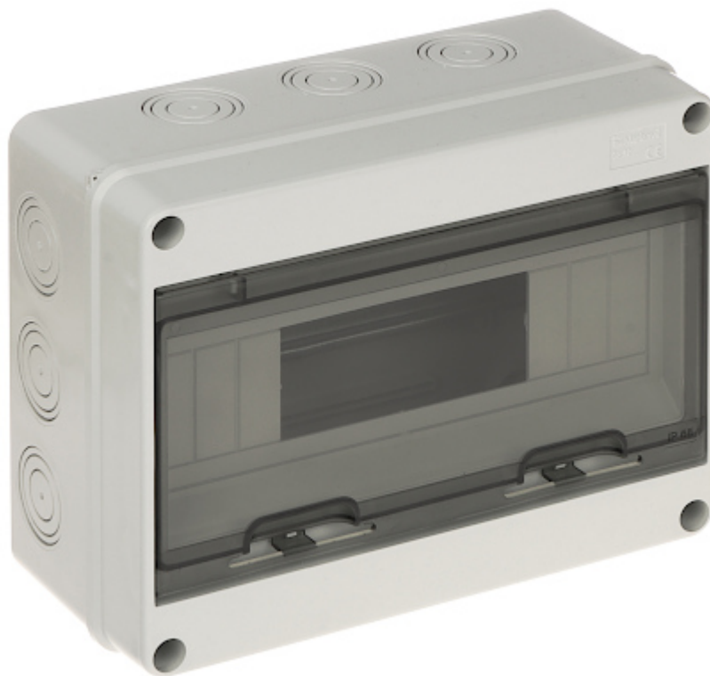
1-row 12-modular surface-mounting, hermetic distribution electric cabinet.

The device must be secured against contact with caustic, staining and viscous fluids.