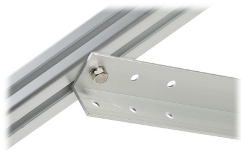
Mounting clamp for the solar panel: