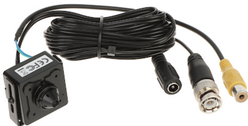
Camera is very small: