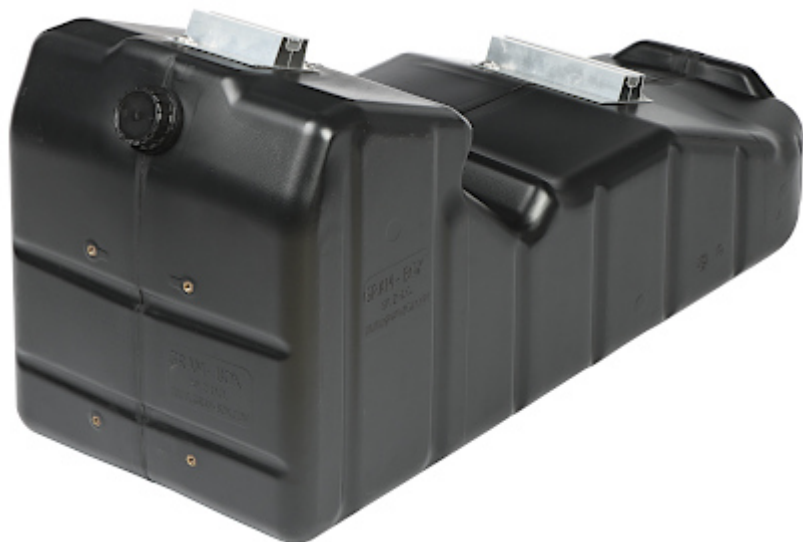
Inlets with M8 thread - rear: