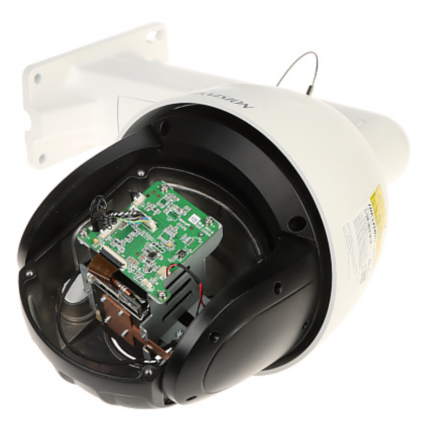
\ensuremath{\mathsf{Micro}} SD card slot is located inside the camera: