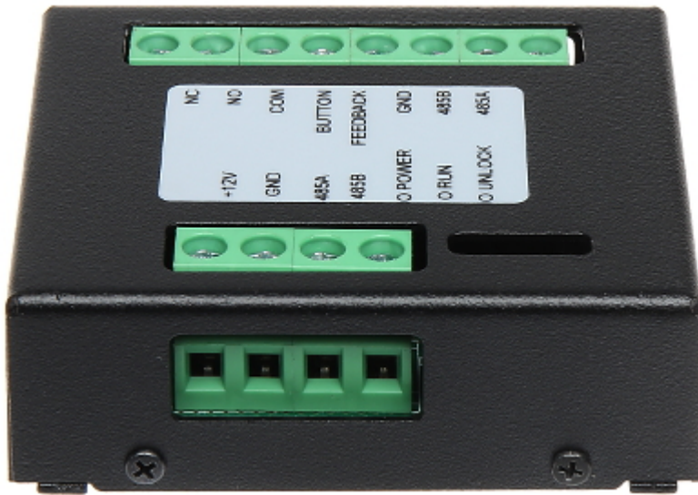
Mounting side view