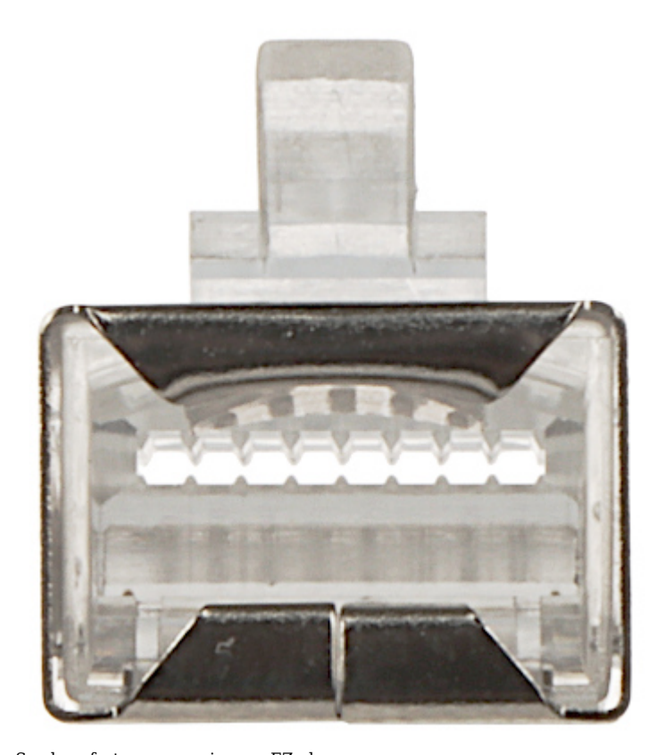
See how fast you can crimp an EZ plug:

User Manual Code: RJ45T-EKRAN*P100 SHIELDED MODULAR PLUG RJ45T-EKRAN*P100 EZ TYPE