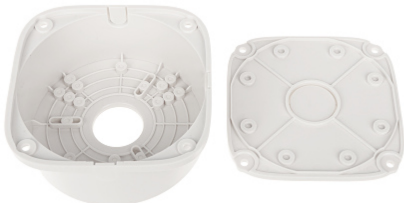
Wall mounting side view: