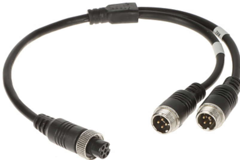
Connection cable terminated with M12, 6-pin plug and M12, 4-pin sockets.

The device must be secured against contact with caustic, staining and viscous fluids.