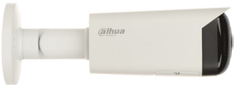
Memory card slot: