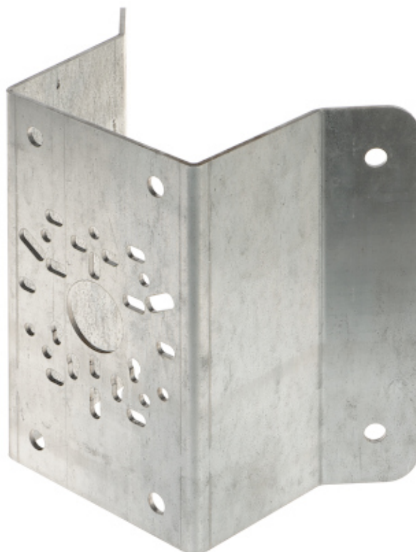
Camera bracket, which enables camera installation on the building corner.

The device must be secured against contact with caustic, staining and viscous fluids.