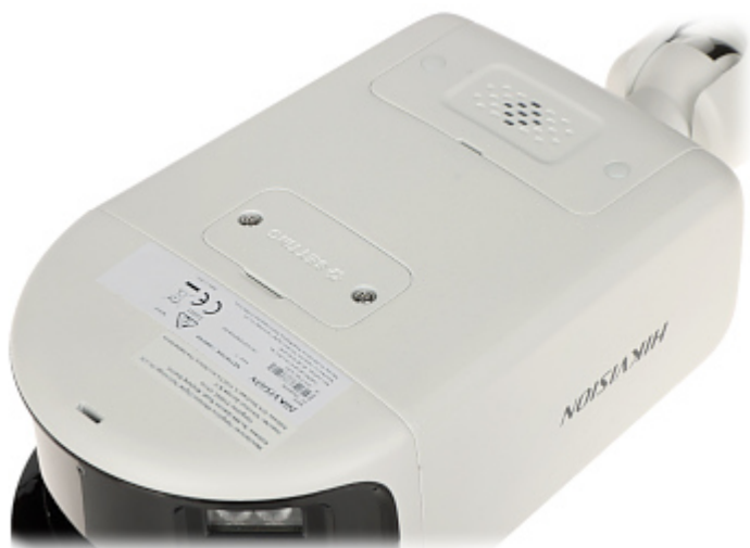
Memory card slot and "Reset" button: