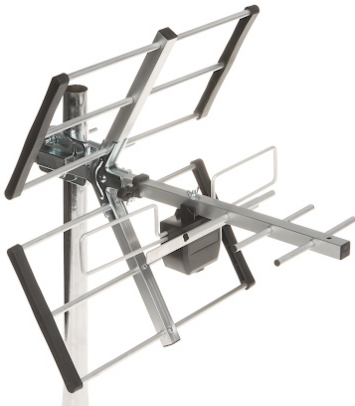
Antenna connector (bottom view):

The antenna is installed in the compact version: