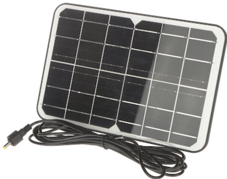
Solar panel connector: