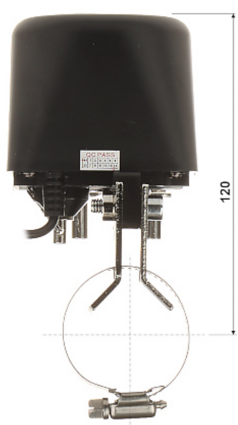
Example of application:

User Manual Code: ATLO-V1-TUYA VALVE ACTUATOR ATLO-V1-TUYA Wi-Fi, Tuya Smart