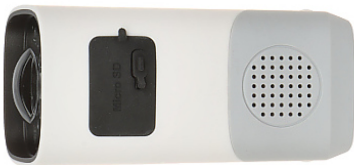
Memory card slot, micro USB and "Reset" button: