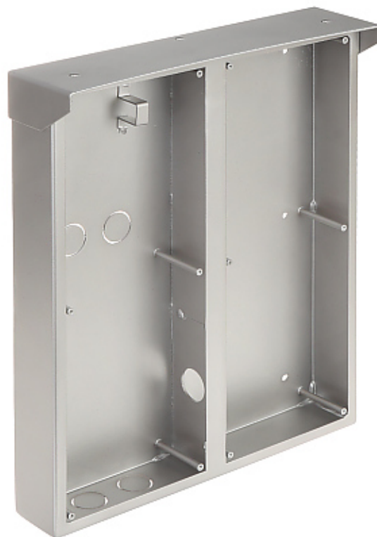
The surface mounting box with rain-shield is dedicated to the DAHUA VTO4202F-x series devices.

The device must be secured against contact with caustic, staining and viscous fluids.